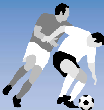
Shielding the ball

Some skills are absolute “must-haves” for all players – and are so important that you should teach them first. What’s the most important?